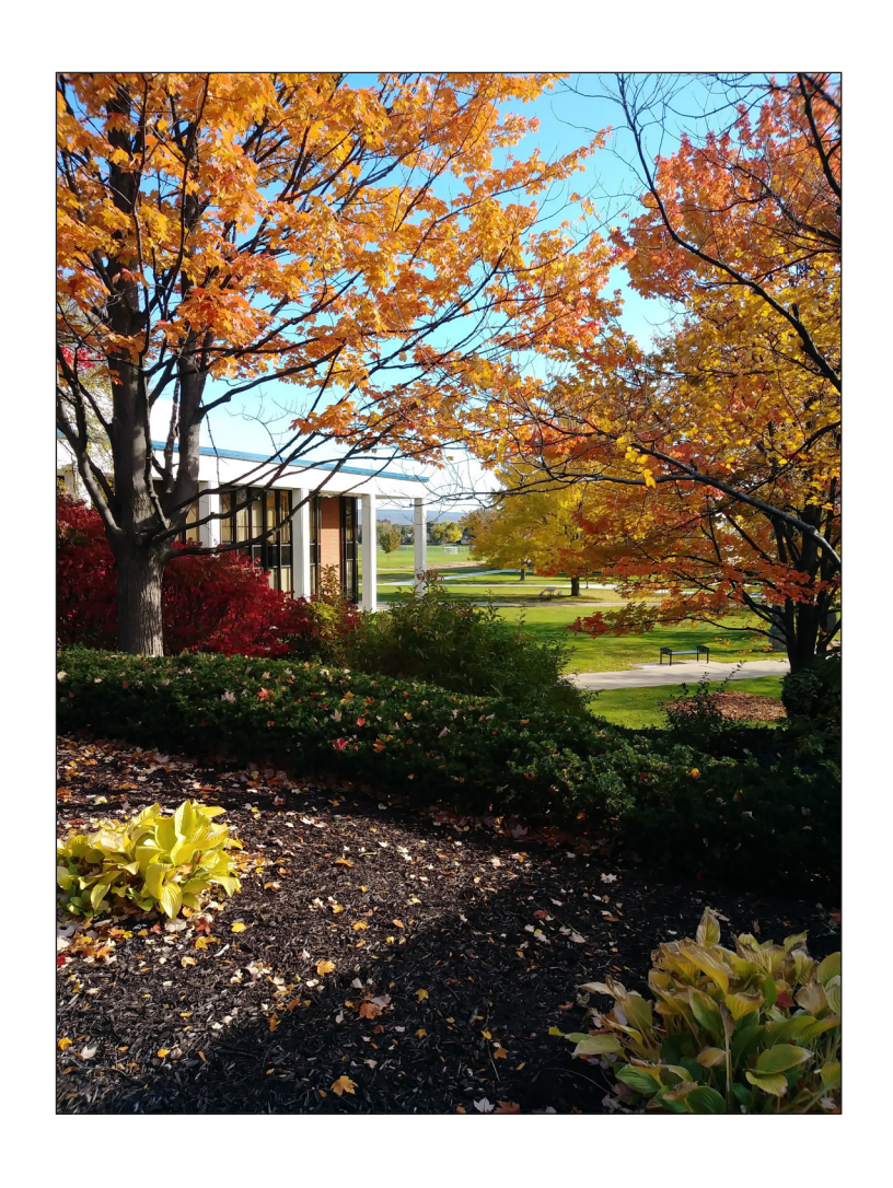
Olivia Harwick Beautiful day by DePerno Hall