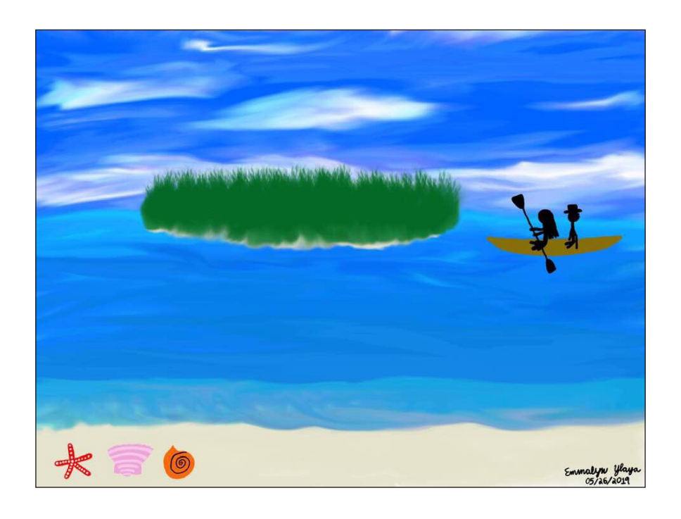
Emmalyn Ylala From Beach to Island